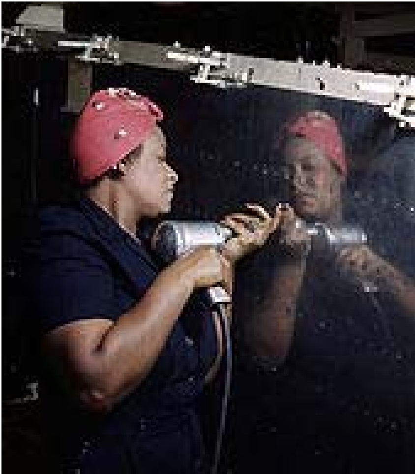
Real life “Rosie, 1943)